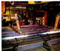
Modules are robotically welded